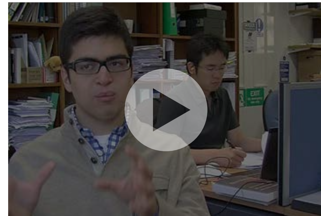
CLICK TO PLAY VIDEO

Students also have the opportunity to write a substantial thesis. This provides experience in conducting a major piece of investigation in the field of evidence-based social intervention that builds on the skills learned throughout the course. It allows students to contribute to the growing body of knowledge in relation to the study of evidence-based practice and to make evidentiary, ethical and application contributions to practice itself.