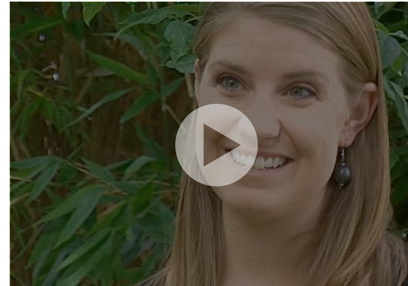
CLICK TO PLAY VIDEO

In their first year, MPhil students will begin to design a research project and will write a 30,000 word thesis due at the end of their second year. Due to time constraints, the MSc thesis often has to make use of secondary analysis of existing literature or data, but MPhil students have more time and scope to conduct primary research.